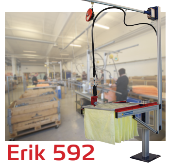
Assembly workbench for standard filters. Can be completed with Jonas / Thomas / Roger.