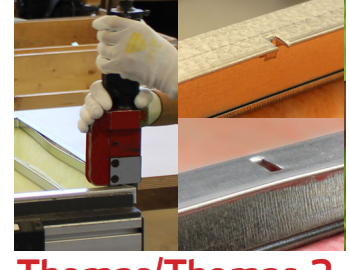
Thomas/Thomas 3 Tab punch for joining collar bag to outer frame.