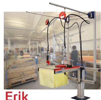
Assembly workbench for non-standard and standard filters. Can be completed with Jonas / Thomas / Roger.