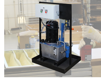
Roger 1 Hydraulic unit for Jonas / Thomas / Niklas. max 2 units.